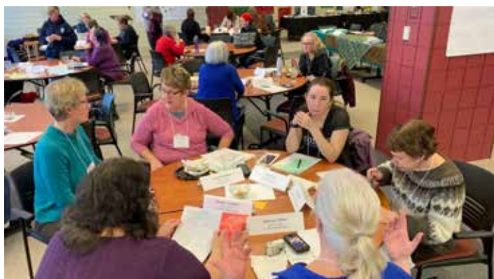
Presidents gather to discuss agenda