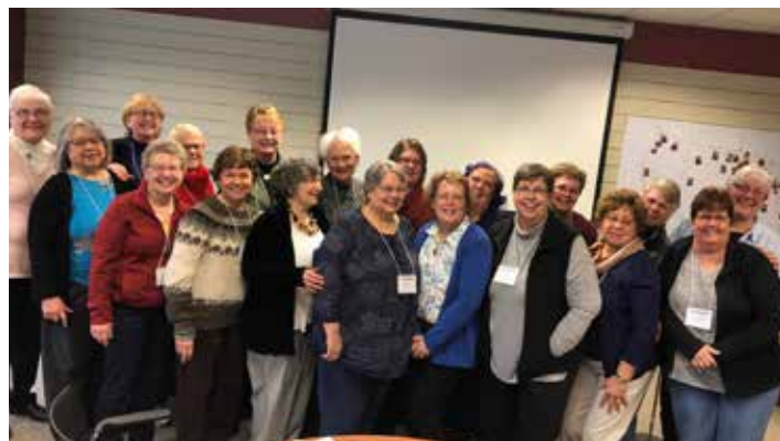
Outgoing presidents say goodbye