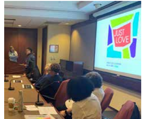
Staff unveils Gathering 2020 logo and theme (See page 1)